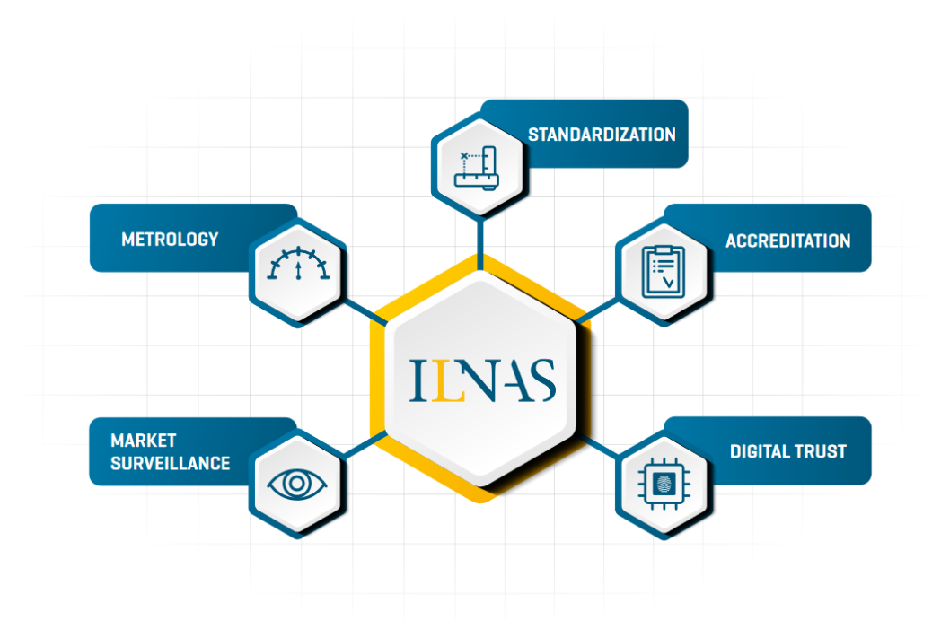
Figure 2: The departments of ILNAS

ILNAS ( Institut luxembourgeois de la normalisation, de l'accréditation, de la sécurité et qualité des produits et services ) is a public administration under the authority of the Minister of the Economy, SME, Energy and Tourism of the Grand Duchy of Luxembourg. Founded in 2008, ILNAS represents a network of competencies relating to quality, safety and conformity of products and services (see Figure 2), and its mission is to support national competitiveness. One of ILNAS' missions is to promote technical standardization. As such, it is the Grand Duchy's National Standards Body. ILNAS organizes its standardization work according to the <a href="Luxembourg Standardization Strategy 2020-2030">Luxembourg Standardization Strategy 2020-2030</a>, and associated <a href="ICT">ICT</a>, <a href="Construction">Construction</a>, <a href="Aerospace">Aerospace</a>, <a href="CASCO">CASCO</a> and <a href="Sustainable Development">Sustainable Development</a> national technical standardization policies.